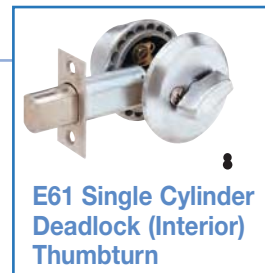
E61 Single Cylinder Deadlock (Interior) Thumbturn

Cylinder Options – Accepts 6 or 7 pin interchangeable cores. Supplied less cores. Will accept Best™ or Falcon™ type cores.