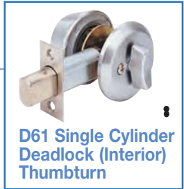
D61 Single Cylinder Deadlock (Interior) Thumbturn

Cylinder Options – Accepts 6 or 7 pin interchangeable cores. Supplied less cores. Will accept Best™ or Falcon™ type cores.